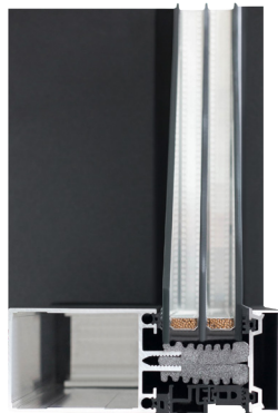
CW Triple Pane