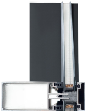
CW Double Pane